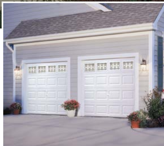
Model T42S, Short Traditional Panel with Optional Short Trenton® Window Design