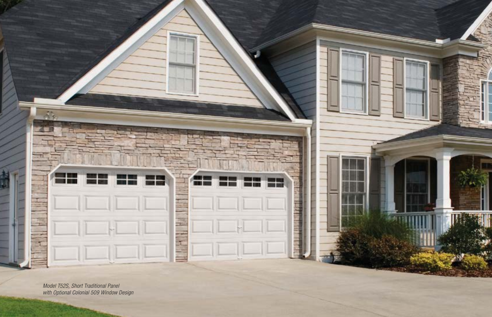
Model T52S, Short Traditional Panel with Optional Colonial 509 Window Design